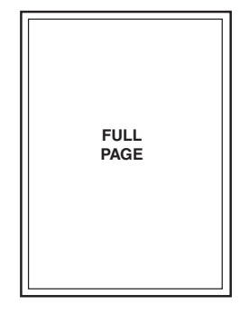
DIAGRAM OF AD SIZES